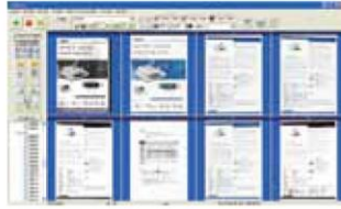
The AvScan 5.0 main screen

-The Intelligent Document Management Tool