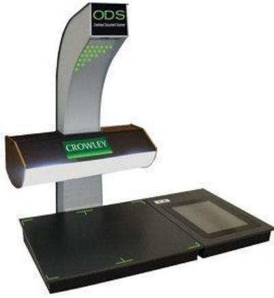
Crowley Overhead Document Scanner