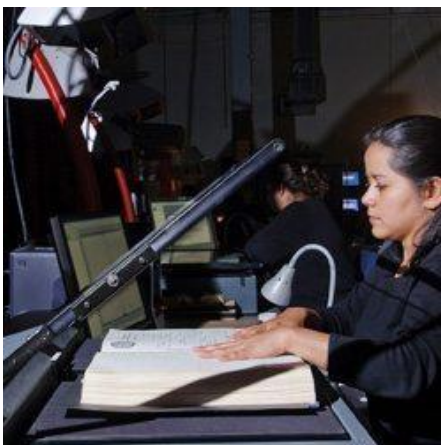
Nexus Imaging is committed to helping preserve history one collection at a time.

We're continuing our partnership with Tilbury consulting them on Phase II of their digitization project. This step will entail selecting production level scanners for archivist use and a cloud strategy for public access.